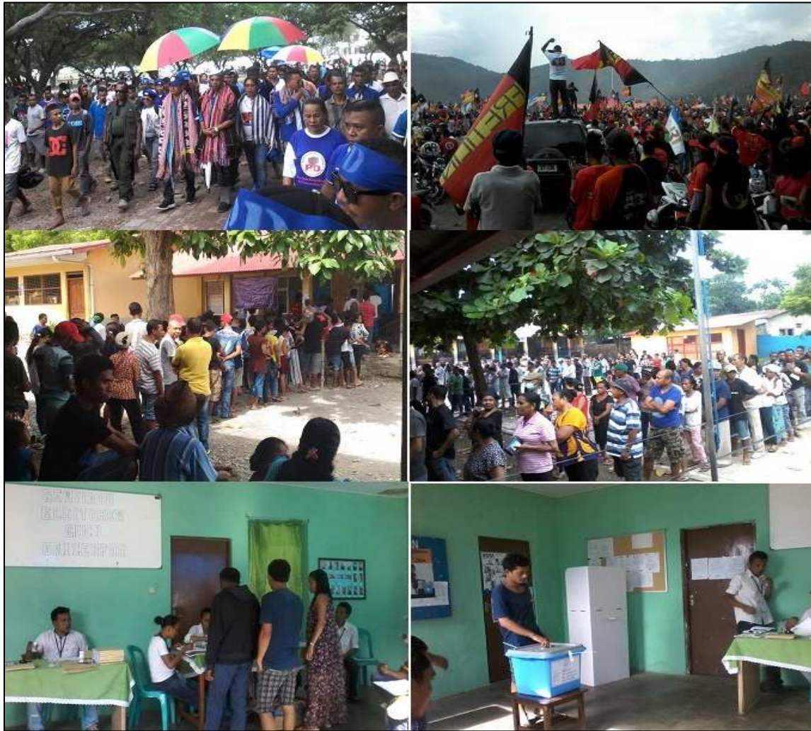
NGO Belun's documentation, Campaigns and Presidential Election, 20 March 2017